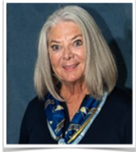
Libby Day Membership